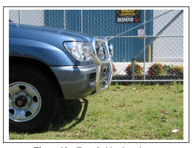
Figure 10 – Type 8 side view shown