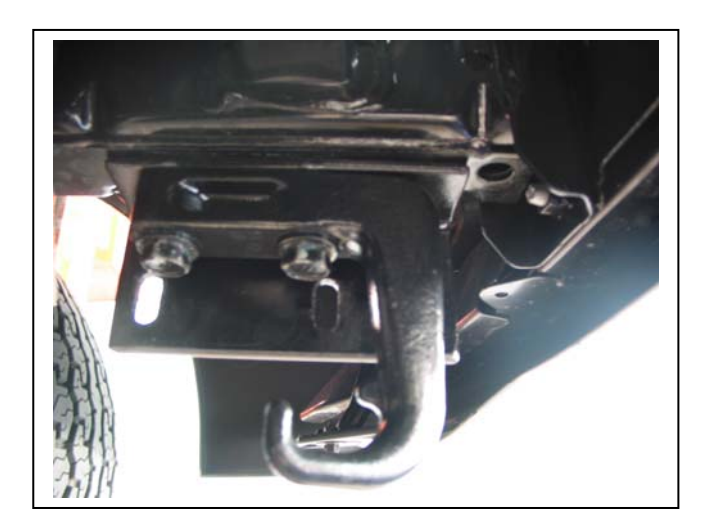
Figure 1 – Passengers side shown