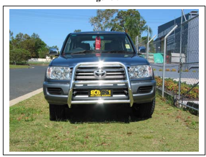
Figure 7 – Series 2 Nudge Bar front view shown