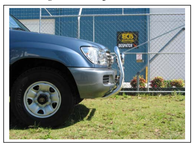
Figure 8 – Series 2 Nudge Bar side view shown