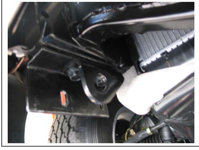
Figure 2 – Drivers side shown