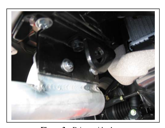
Figure 3 – Drivers side shown