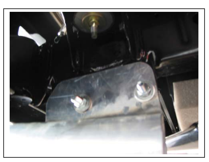
Figure 4 – Passenger side shown