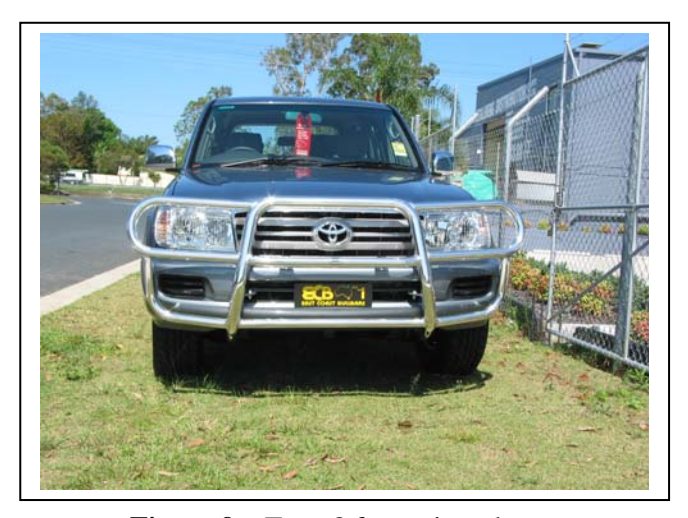
Figure 9 – Type 8 front view shown